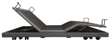
Low Zero-G Position

HI-LO ADJUSTABLE BASE | TRENDLENBURG TILT