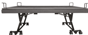
Hi Flat Position