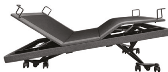
Trendelenburg Reverse Zero-G