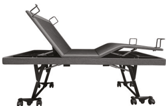
Hi Reading-TV Position